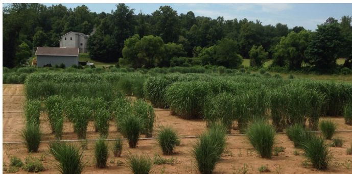
Various research plots of energy grasses at the Mountain Horticultural Crops Research and Extension Center, Mills River, NC.

CONCLUSION. There are many biomass feedstocks choices available to produce electricity, heat, and transportation fuels. They are usually categorized as woody or non-woody biomass and are derived from a variety of sources. Woody biomass feedstocks can be collected from logging residues, urban and industrial residues, forest thinnings and short-rotation woody crops. Non-woody biomass feedstocks can originate from animal wastes, landfill gas, bioenergy crops, and agricultural and manufacturing residues. Most biomass feedstocks are delivered as a processed densified material in the form of chips, briquettes, bales, or pellets. The public and private sectors are constantly working on increasing efficiencies throughout the supply chain as well as improving bioenergy crop species to allow for biomass feedstocks to be more cost competitive with other energy sources such as fossil fuels.