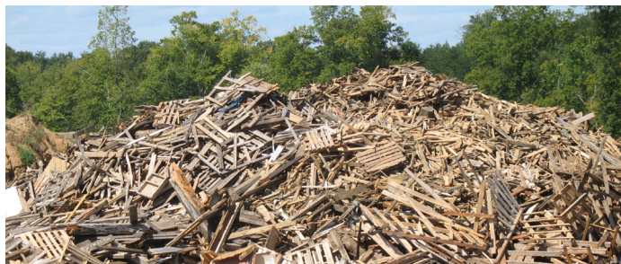
An example of a wood waste pile.

WHY PELLETIZE? Pelletizing clean chips or pulpwood increases the energy content by volume and density and decreases the transportation cost of hauling excess moisture, leaves, and bark.