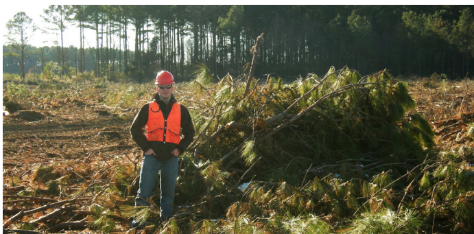
A pile of logging residues after a timber harvest on a southern yellow pine plantation in eastern North Carolina.

LUMBER MILL RESIDUES. Lumber mill residues include sawdust, shavings, and other waste from processing timber. This by-product is often used to fire the dry kilns or wood-fired boilers of the facility, thus producing some of the energy needed on site. Other times, residues are sold to other mills to make animal bedding, or pelletized and bagged for home heating in stoves. Throughout the Southeast, most mill residues are already utilized providing electricity to mill operations or sold to another mill to be converted to a higher-end product.