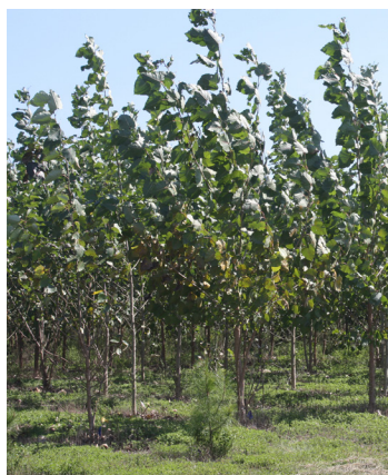
A research plot of hybrid poplars short rotation woody crops at the Williamsdale Biofuels Field Laboratory, Wallace, NC.

and grandis , urophylla and their hybrids preferring more subtropical climates. SRWC are generally harvested in 1- to 6-year intervals, and coppiced woody crops can provide 3-6 harvests before replanting. Coppicing refers to cutting trees to the ground and then letting the shoots regrow from the main stump. SRWC can be harvested year round and is easier to transport, handle, and store than bioenergy grasses