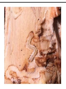
Kelly Oten <u>CC BY - 4.0</u>